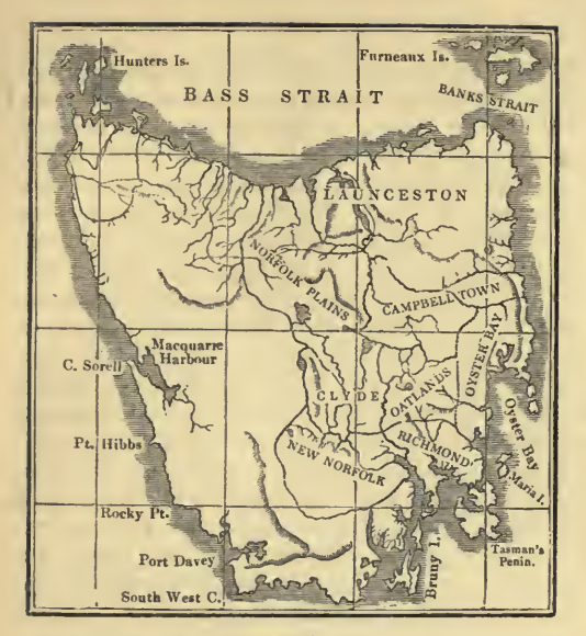
VAN DIEMEN'S LAND.