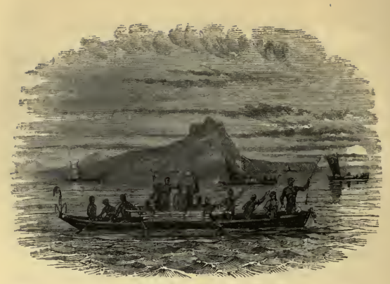
NATIVES OF THE MURRAY ISLANDS IN BOATS.