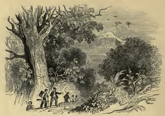
TRAVELLERS IN THE BUSH.